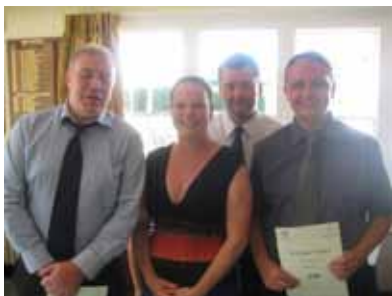
London Hibs Supporters