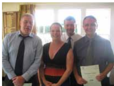
London Hibs Supporters