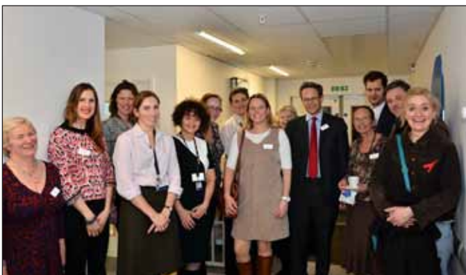
Chelsea & Westminster Handover from DFFB

A delightful Reception was organised at Chelsea & Westminster Hospital's new Adult Burn Unit. Trustees of Dan's Fund for Burns were invited to celebrate the new Burns Unit around which they given a wonderful tour, as well as being thanked very warmly by staff for the huge contributions donated by the Trust. This included a Laser Doppler machine, which costs in the vicinity of £50,000. The machine assesses the blood flow in a burn injury using a laser beam; a picture is produced with different colours which helps guide the surgeon on whether or not surgery is required. Pink and red areas